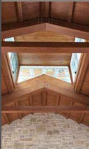
Shiplap - Beams - T&G