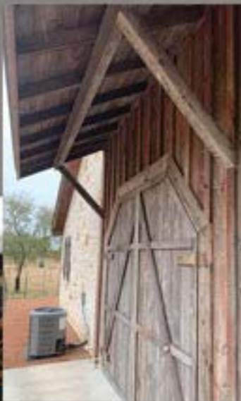
Texas Ranch Wood